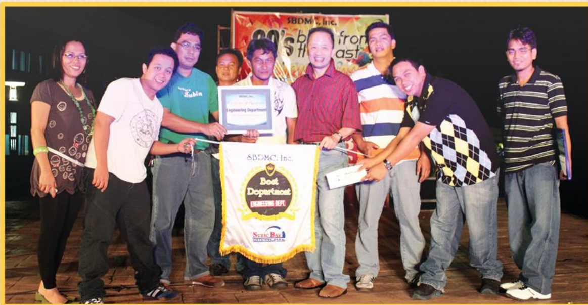
The Engineering Department (ED) was voted as the Best Department for the second semester of 2010. This is the second straight semester that ED has bagged the Best Department award.