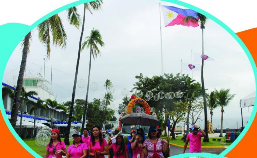
SBMA Foot and Float Parade (November 24, 2017)