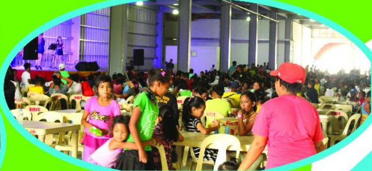
MSK Outreach Activity (December 21, 2017)