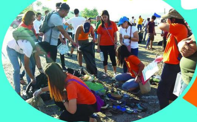
International Coastal Clean Up (September 16, 2017)