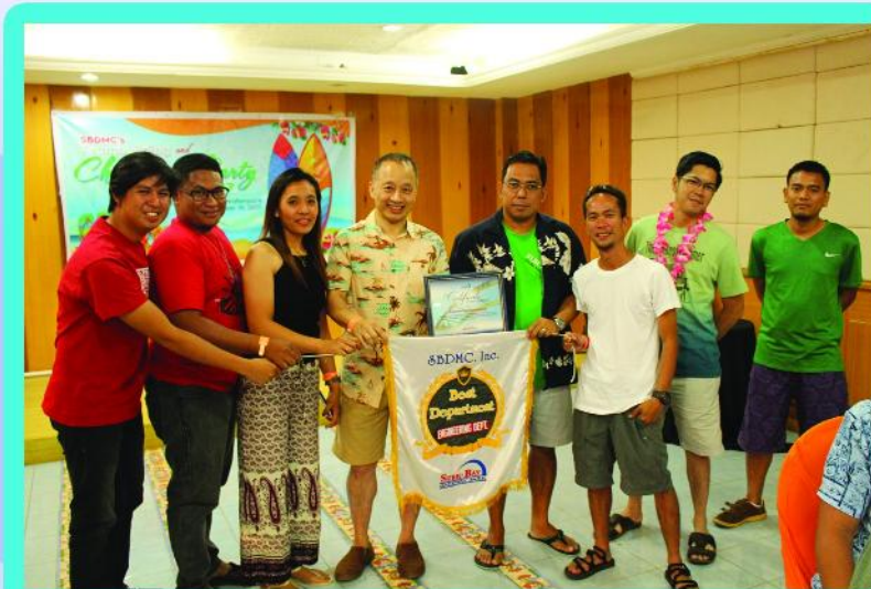
BEST DEPARTMENT 2017 Engineering & Technical Dept.